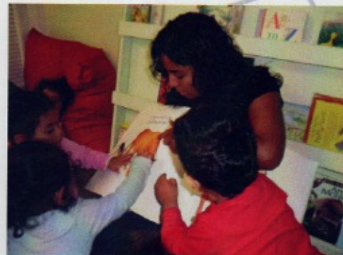
Children engage in Literacy