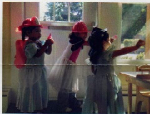
Princess Firefighters Put Out Fires with Baby Bottles- At Dramatic Play Children Practice Roles