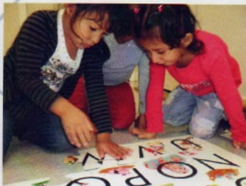
Learning our ABC's - Hands-On