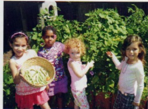
The Children's Garden: Where both the children and the plants grow