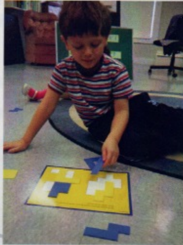
Discovering Mathematical Relationships